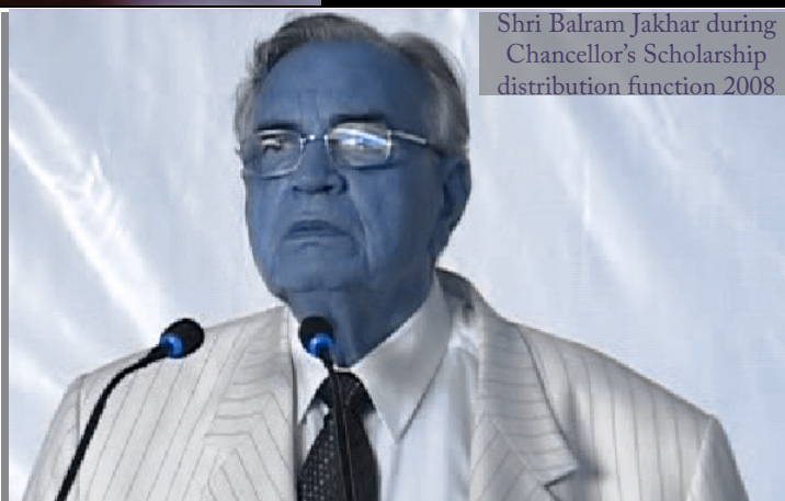
Shri Balram Jakhar during Chancellor's Scholarship distribution function 2008

Former Chancellor RGPV, Former Governor Madhya Pradesh and also the Former Lok Sabha Speaker, Shri Balram Jakhar left for his heavenly abode on 3 rd February 2016. As a Chancellor he was instrumental not only in inspiring growth of the University but also in motivating students to achieve academic excellence and become nation builder through his motivating speeches and charismatic personality. His tenure as a Chancellor of the University was adorned with multifarious achievements, which include inception of Chancellor's Scholarship for promoting meritorious learners coming from all sections of society. We pay our sincere homage and tribute to our beloved former Chancellor, Shri Balram Jakhar for his undying spirit, unmatched vision and towering contribution towards growth and development of this University.